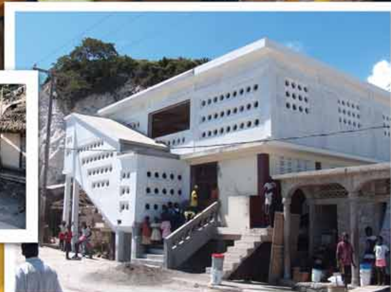
New St. Pierre School